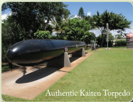
Authentic Kaiten Torpedo